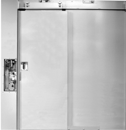
Shown with 1058M Lock and Optional Lock Mounting Pilaster